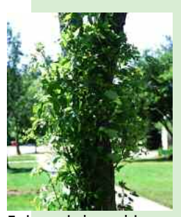
Epicormic branching or suckers